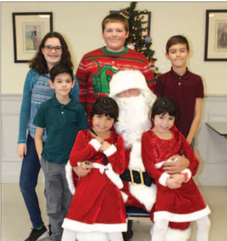
Chicago area youth members had the opportunity to visit with Santa at the annual Chicago District Federation Christmas party.

The annual Chicago District Federation meeting will be held Feb. 29 at 1:30 p.m. at the Slovenian Catholic Center in Lemont.