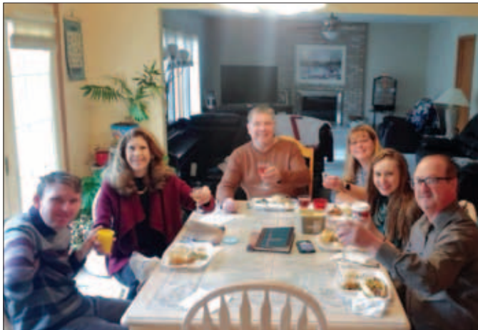
Cicero Neighbors Lodge 449 members toasted the holiday season during their annual meeting in November.