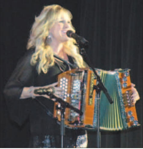
[Above] Nashville polka recording artist LynnMarie performed during the 32nd annual Polka Music Awards Show, presented by the National Cleveland-Style Polka Hall of Fame on Nov. 30, 2019.

The Polka Hall of Fame and Museum is located at 605 East 222nd St. in Euclid, Ohio. For more information, visit the Polka Hall of Fame website, www.polkafame.com , or phone (216) 621-FAME.