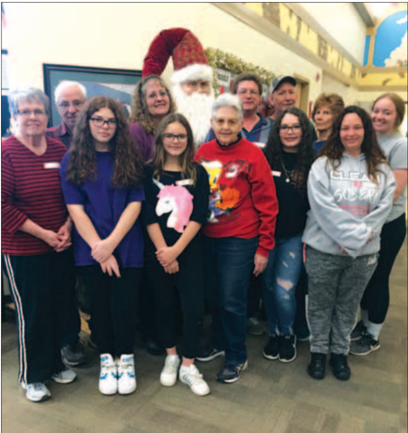
Pueblo Lodge 577 members visited the Colorado State Veterans Home in early December to complete their weeks-long project of decorating the facility for the residents.