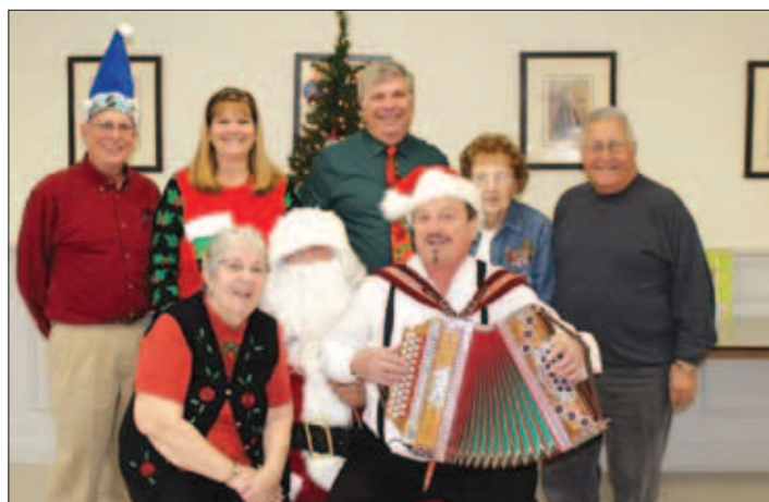
Chicago District Federation officers shared their Christmas wishes with Santa during the annual Federation Christmas party held Dec. 7.