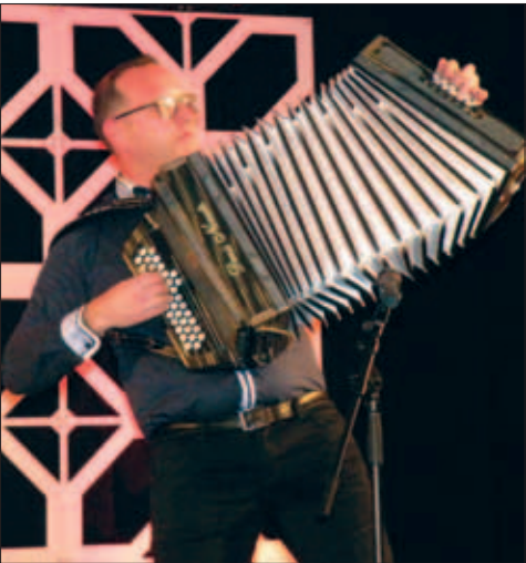
[Below] World diatonic accordion champion Denis Novato arrived from Italy to perform at the 2019 Polka Hall of Fame Awards Show.