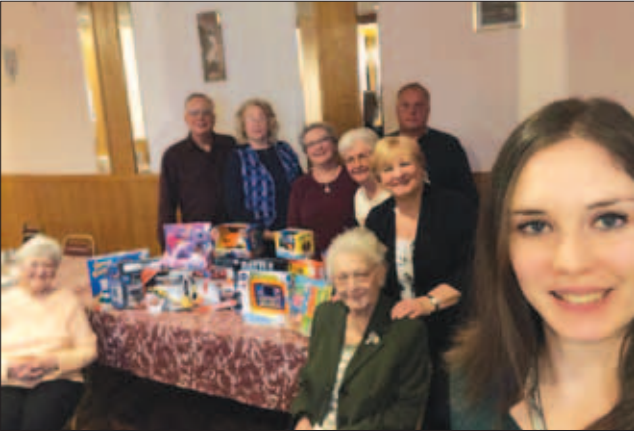
[Above] Pioneer Lodge 559 hosted a toy drive during the November meeting, donating the items collected to the LaGrange, Ill., American Legion Post Toys for Tots campaign.

Please be sure to follow our Facebook page, @SNPJLodge559, for more up-to-date information on Lodge 559 meetings and events. We wish everyone a great 2020!