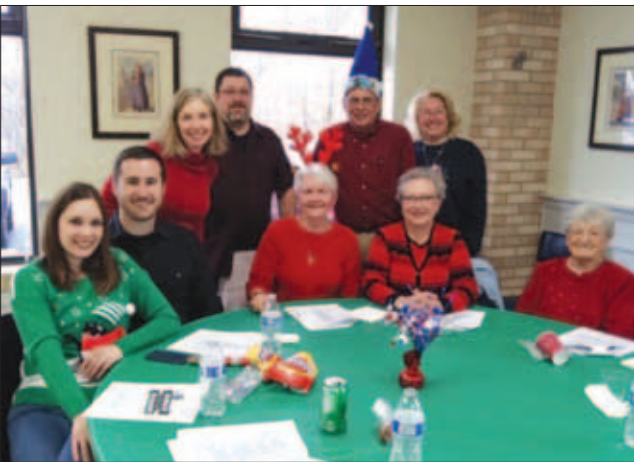
[Below] Lodge 559 members in attendance at the annual Christmas party sponsored by the Chicago District Federation in December.