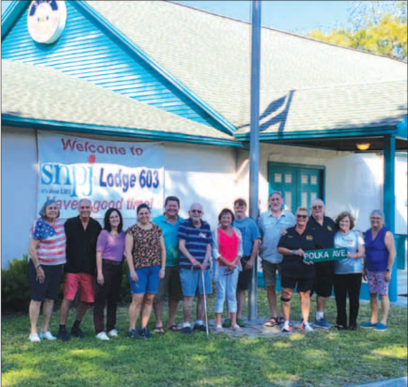
SNPJ Lodge 603 officers greeted a group of northern SNPJ members as the Lodge hosted the annual Florida SNPJ Days celebration in February.