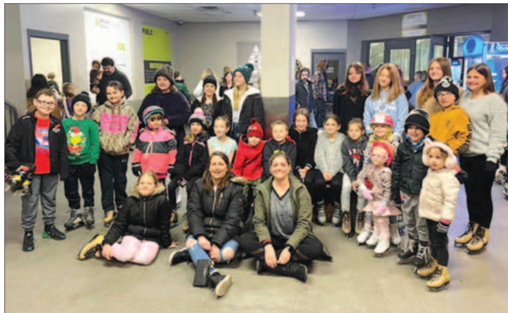
In January, the members of SNPJ Youth Circle 19 in Strabane and Youth Circle 36 in Sygan enjoyed an evening of ice skating at Printscape Arena in Canonsburg, Pa.

The next two PROSVETA issue dates are May 2 and June 1. All material must be received by noon on Monday, April 18, for the May 2 issue, and by Monday, May 9, for the June 1 issue. If you’re concerned about making the deadline, send an e-mail to prosveta@snpj.com or submit your material via the publications area of our website, snpj.org .