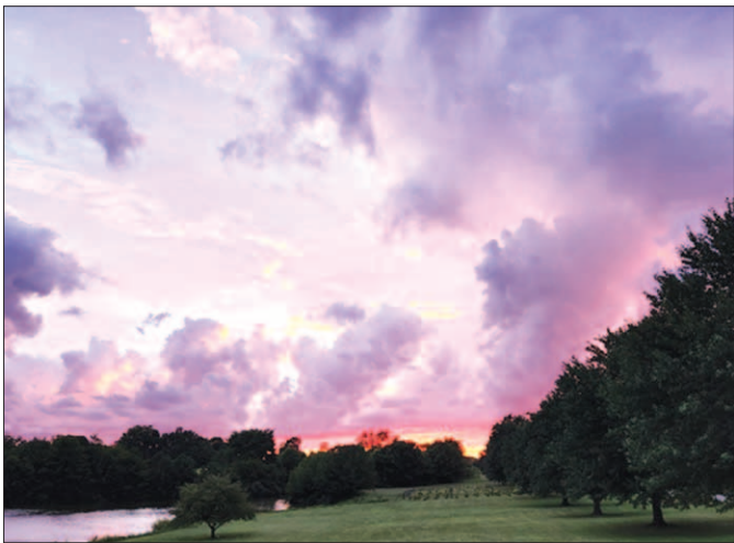
A gorgeous sunset, the finale to a beautiful 2022 SNPJ Family Week.