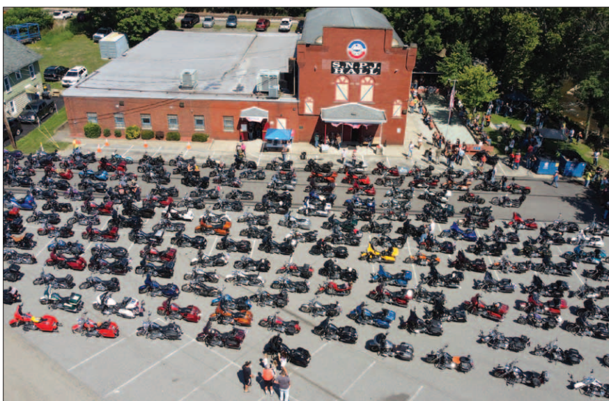
The parking lot at the Lodge 138 Hall in Strabane was filled to capacity with an estimated 300 motorcycles when the Lodge welcomed participants in the Wounded Warrior Project Bike Run on Aug. 28.