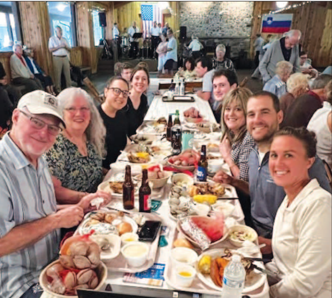
SNPJ Lodge 142 picnickers feasted on their choice of a clam or chicken bake while enjoying the music of the Eddie Rodick Orchestra, while the younger picnic attendees stayed busy taking their best shots at a rocket-shaped piñata.