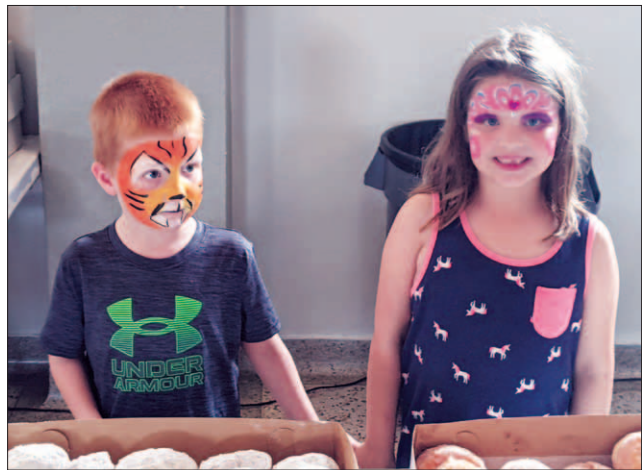
Even the youngest SNPJ Lodge 34 members worked to support the Indianapolis Slovenski Fest by selling the krofe donated by the Lodge.