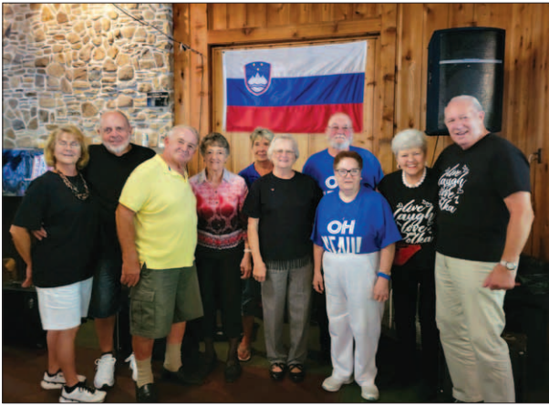
[Above] St. Marys, Pa., Lodge 581 members enjoyed a combined summer picnic with the North Central Pa. Polka Boosters in August, and several Lodge members made the trip to the SNPJ Farm in Kirtland, Ohio, to attend the Slovenian Sausage Festival in September [left].

Kersey Firemen’s. We will hold election of officers and have a dance afterward. The meeting starts at 12:30 p.m. and the dance follows from 2 to 5 p.m.