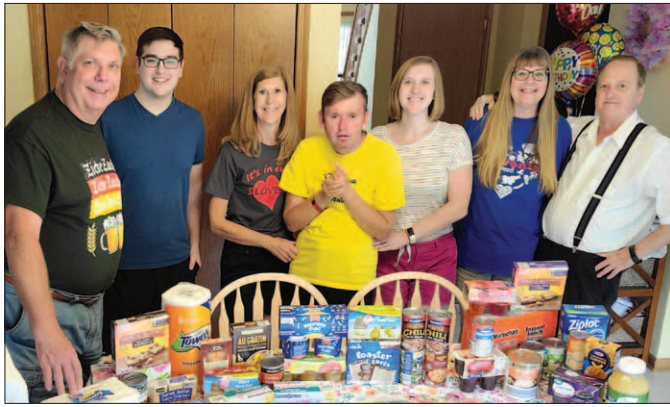
Cicero Neighbors Lodge 449 members are planning a visit to the Ronald McDonald House in Chicago to drop off their donations of food, paper products and books.

Our next meeting will be held Nov. 20 starting at 1 p.m. This is our annual meeting and will include our holiday luncheon.