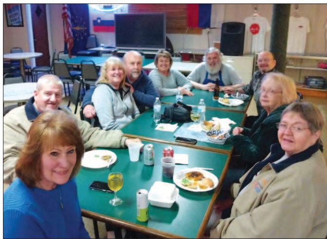
SNPJ Lodge 34 members hosted the Indianapolis SNH dinner in March, preparing and serving the meals.

Currently, the next Lodge 723 meeting is scheduled Thursday, Oct. 12, starting at 6 p.m. at Napoli Restaurant.