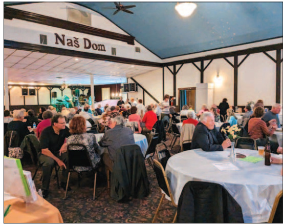
SNPJ members and friends packed the Yukon Slovenian Hall on April 23 as they enjoyed the first annual SNPJ Region 1 Members, Family and Friends Appreciation Dance which offered free admission to all attendees.