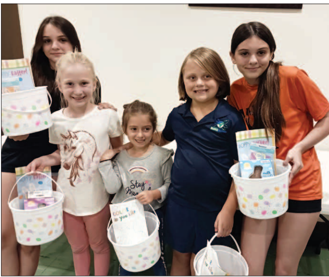
During their annual Easter party, SNPJ Youth Circle 57 members decorated cookies, made Easter crafts and received Easter baskets from the Circle directors.