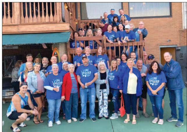
Submitted by Amy Mavrich (138)