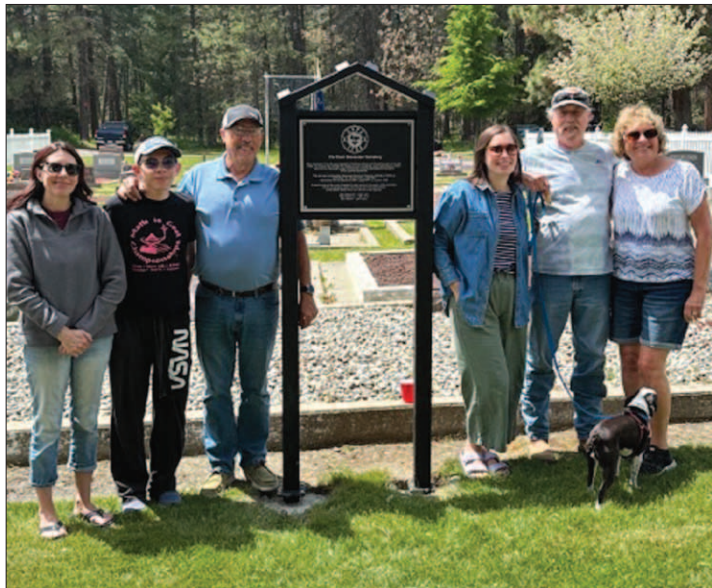
[Left] Lodge 371 members gathered for the dedication of a kiosk and plaque in the SNPJ section of Cle Elum Cemetery on May 27.