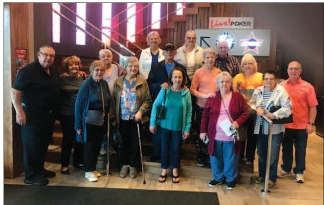
The members of Yukon Lodge 729 getting ready to try their luck at Live! Casino Pittsburgh in Greensburg, Pa.