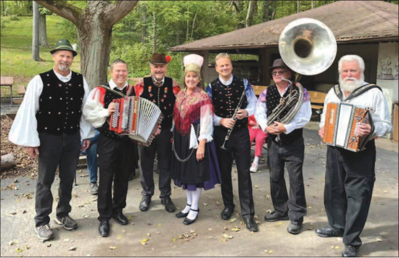
Enjoy dancing, singing and good food at the traditional Slovenian Grape Festival hosted by the SNPJ Farm in Kirtland, Ohio, on Sunday, Sept. 24.