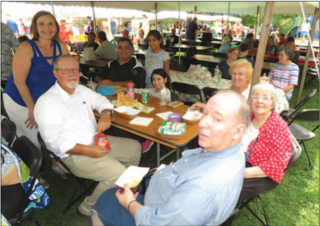
Slavija Lodge 1 members attending the Slovenian Cultural Center annual picnic in Lemont, Ill., enjoyed the polka music, Slovenian dancers, food and games.