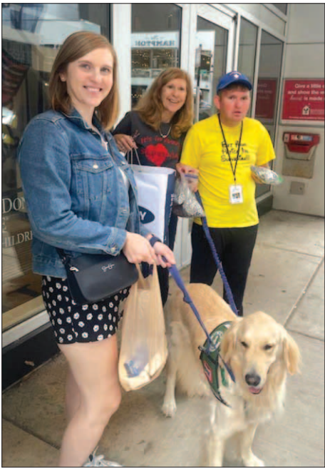
[Above] Lodge 449 members hosted a Chicago-style pizza party during their September meeting, then distributed the gifts and pop tabs that Lodge members had collected for a local Ronald McDonald House [left].

members attended included the Slovenian Catholic Center annual picnic on Aug. 13 and the annual Honey Picnic on Aug. 27.