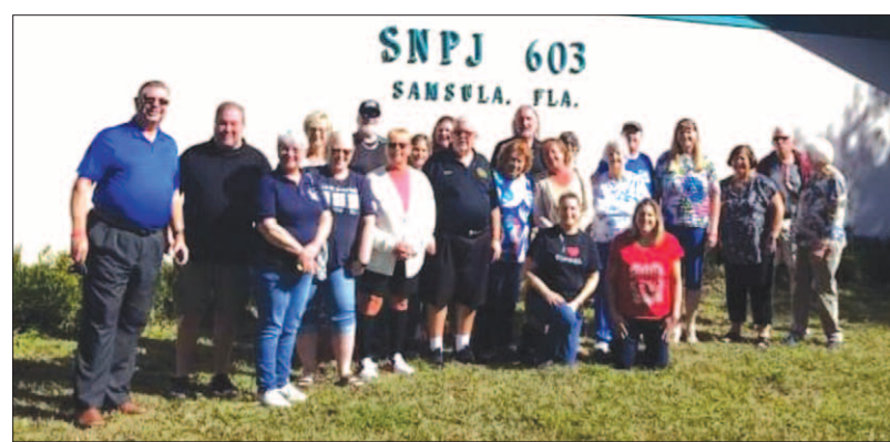
SNPJ members from Lodges in the north chased away the winter chill at Florida SNPJ Days, held Feb. 23-24 at SNPJ Lodge 603 in Samsula.