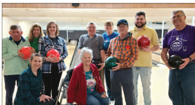
At the conclusion of their March meeting, Lodge 449 members hit the lanes for some friendly competition.

After the meeting, all adult members, youth members and