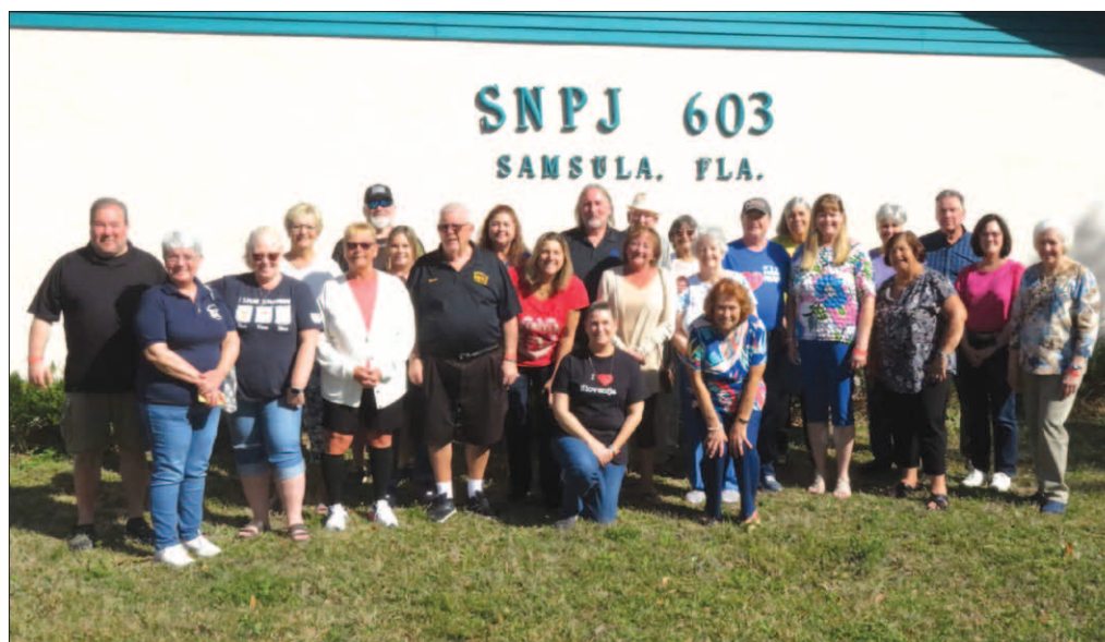
The Florida SNPJ Days celebration always draws a crowd of members from the northern Lodges, all of whom are eager to escape winter and spend some time in the Florida sunshine.