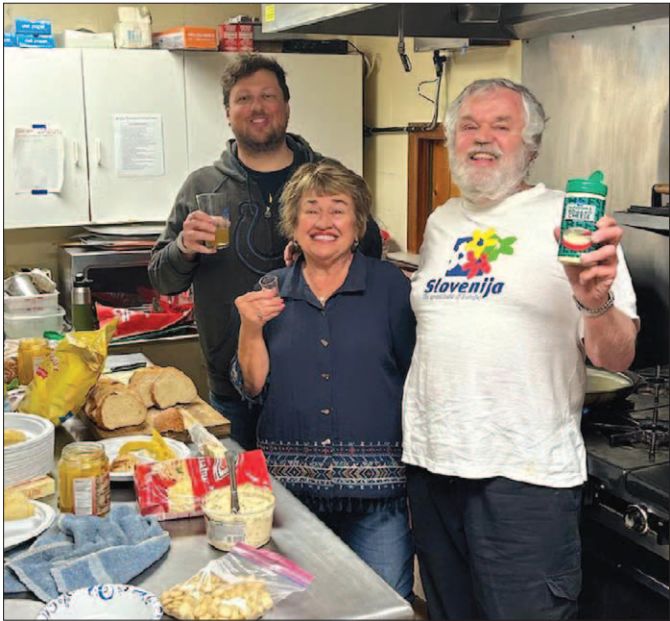
The gourmet grilled cheese dinners served by SNPJ Lodge 34 members are always a hit at the Indianapolis SNH.

Our second quarterly meeting will be held Saturday, June 22, at the SNH starting at 3 p.m. The SNH is hosting a Slovenian Independence Day festival that day, and our Lodge has agreed to help with the many festival activities, donate krofe, and prepare a Slovenian soup. Please try to attend the meeting and enjoy the festival.