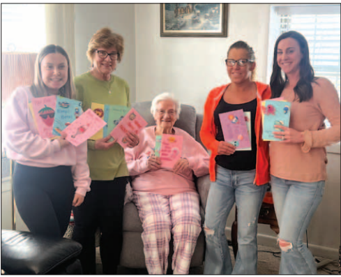
Lodge 518 members creating and displaying the cards they designed for Cards for Hospitalized Kids.