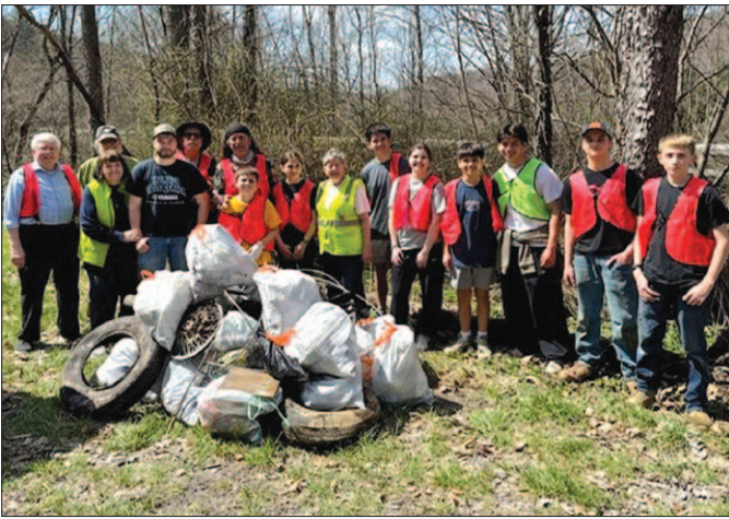
Adults and teens worked together on the SNPJ Lodge 581 cleanup crew to collect waste along Jackson and West Creek Roads in St. Marys.

ganized by Lodge 581, fellow SNPJ members completed 30 Slovenian language classes by the end of April. Several of the participants are planning to visit Slovenia and hope to meet their Slovenian teacher.