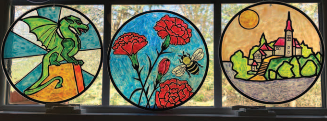
The choice of a dragon, carnation or Lake Bled suncatcher design is offered to participants in the Heritage Center Weekend paint-and-sip activity.

Before closing, I am pleased to announce that the SNPJ Heritage Center will be utilizing QR codes to view the displays in the museum. Committee members Tracey Belle and Sue Mals have been working very hard the past few months to design QR codes that display text or play audio. We now have better Wi-Fi in the Heritage Center museum and gift shop which will allow you to use your smart phone to access the QR codes. The updated Wi-Fi also allows the use of Square for credit card purchases. Stop by the museum and gift shop during Slovenefest to experience these exciting improvements, of which we are very proud.