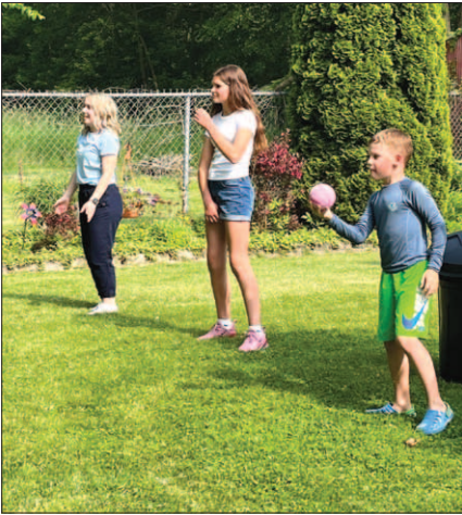
A bubble challenge [above] and Nerf ball toss [left] were added to the SNPJ Lodge 518 picnic activities for 2025.