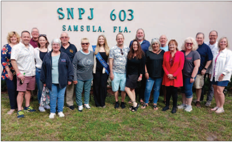
SNPJ members and friends from the northern states enjoy the sunshine and the hospitality of Lodge 603 members during the annual Florida SNPJ Days festivities.