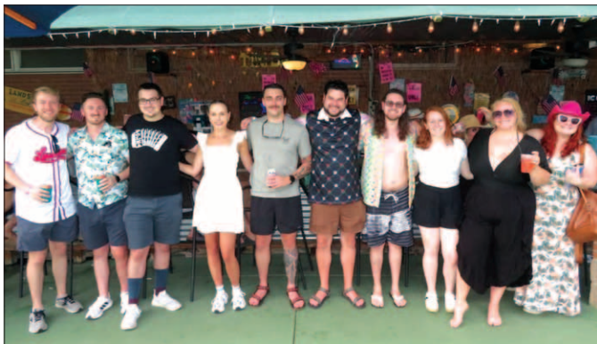
[Below] Lodge 449 young adults joined SNPJ friends from across the country at the Tiki Bar during Slovenefest.