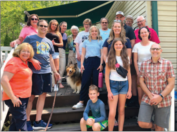
Lodge 518 members ranging in age from 8 to 100 took part in the Lodge's fourth annual picnic held June 8.

With more than 20 participants, this was our best-attended picnic. Members from as far as Saginaw and Lansing, Mich., took part, in addition to members from the Detroit area. Those attending ranged in age from 8 to 100 years old.