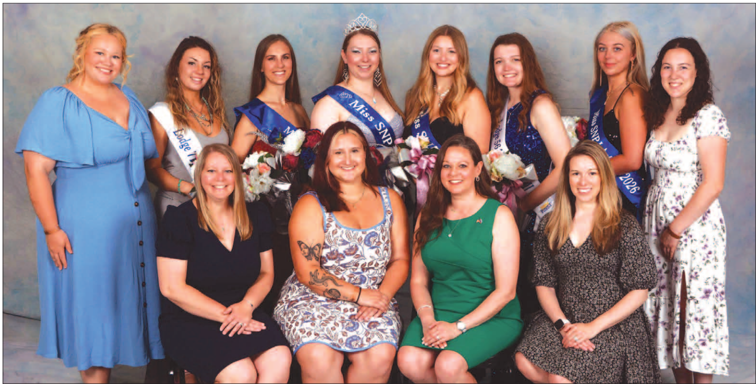
The 2025 Miss SNPJ Pageant contestants and members of the Pageant Committee:

Finally, thank you to everyone who supported the 67th Miss SNPJ Pageant, whether through donations to the Miss SNPJ Pageant Booster Fund, volunteering your time, or attending the event. Your involvement makes this program possible, and we truly couldn’t do it without you. Hvala lepa in na svidenje!