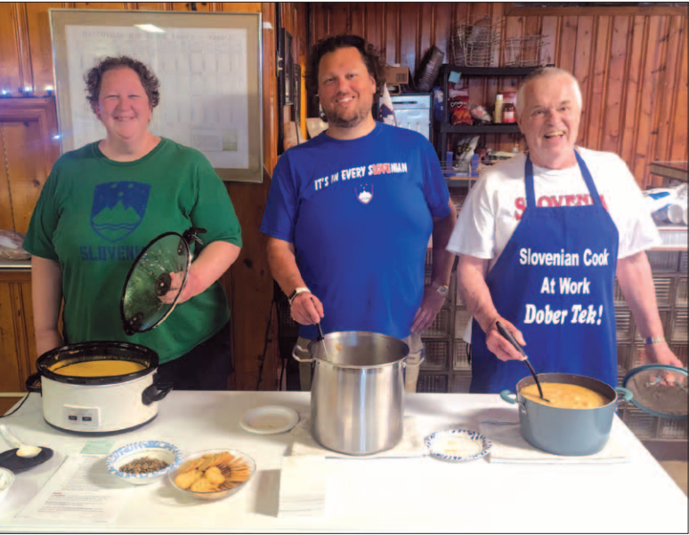
Several soups were offered for the “Taste of Slovenian Soups” served during the Indianapolis SNH celebration of Slovenian Independence Day in June.