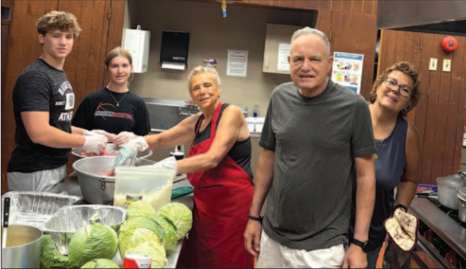
The SNPJ Farm Ladies Auxiliary and assistants manned the kitchen for the Spartans Lodge 576 picnic.