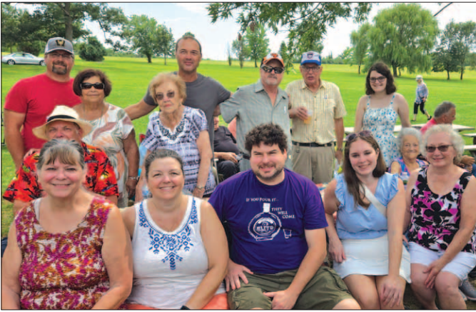
Several members of SNPJ Lodges 8 and 559 attended the Slovenian Catholic Center annual picnic in Lemont, Ill., on Aug. 10.

A short program that included music and folk dancers followed lunch. Games for children and adults – along with and a craft table for all children, led by members of the Slovenian school – were offered in the afternoon. Everyone's favorite, čevapčiči dinners, were made available later in the afternoon.