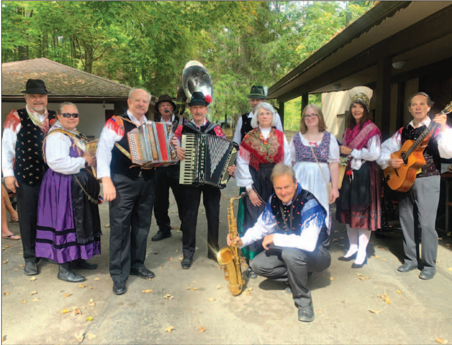
Enjoy an afternoon of good food, dancing and singing at the traditional Slovenian Grape Festival hosted by the SNPJ Farm in Kirtland, Ohio, on Sunday, Sept. 21.