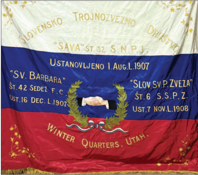
In English, the banner reads: "Triple union of Slovenian Societies. Sava Lodge 32 SNPJ, established Aug. 1, 1907; Sv. Barbara, Lodge 42, headquarters F.C. [Forest City, Pa.], established Dec. 16, 1907; [Lodge name unknown] Lodge 6 SSPZ, established Nov. 7, 1908. Winter Quarters, Utah."