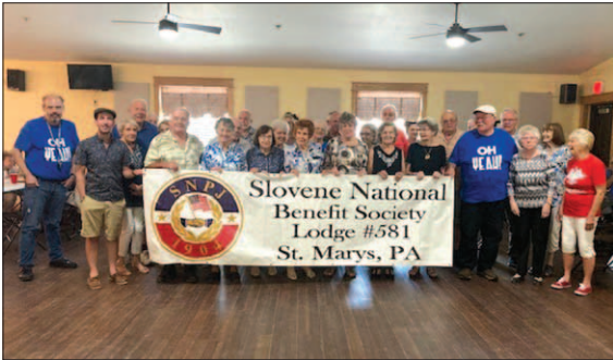
SNPJ Lodge 581 and the North Central Pennsylvania Slovenian Polka Boosters held their combined annual picnic in August, drawing a crowd of more than 60 to the Firemen's Club in Kersey, Pa.