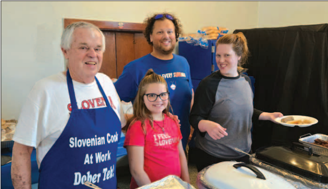
What’s a festival without food? The kitchen crew at the Indianapolis Slovenian National Home served up delicious homemade meals and pastries to the hungry crowd.

I’m looking forward to attending the Slovenski Festival again and meeting up with more Slovenian friends!