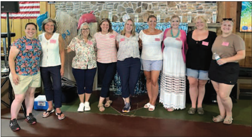
Former Miss SNPJs in attendance at the Family Fun Day picnic.