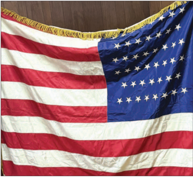
The U.S. flag with 46 stars, sewn to the reverse of the banner.